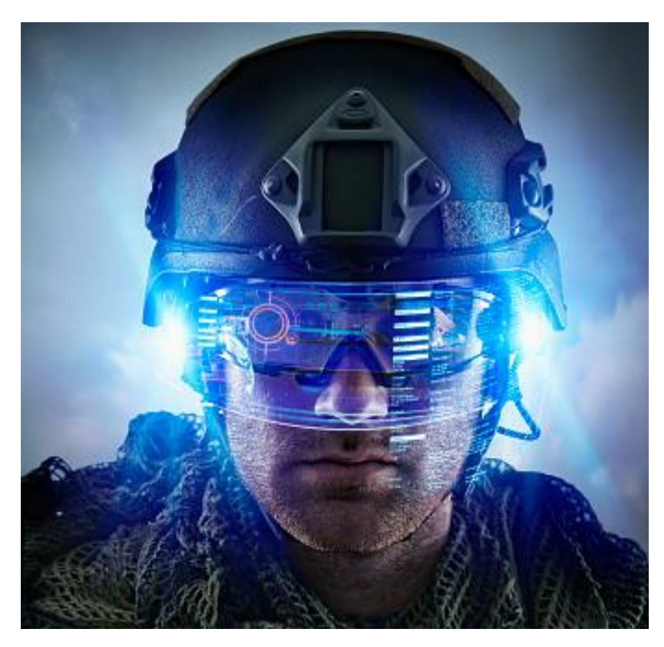
Report The Future War and Deterrence Conference Monday 3 – Wednesday 5 October 2022 | WP3052