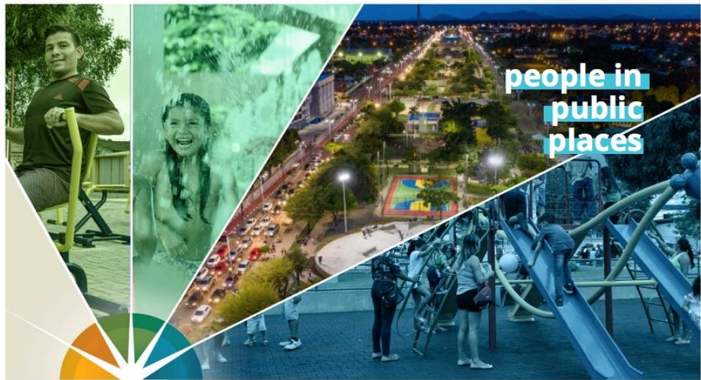
Source: Presentation by Mayor Teresa Surita, Mayor of Boa Vista, Brazil

“We need leadership that is trusted, inspired and which engages people.”